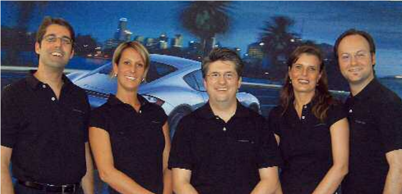
The team of the worldwide Porsche Club Coordination

Dear Porsche Club Presidents, Dear Porsche Club Members,