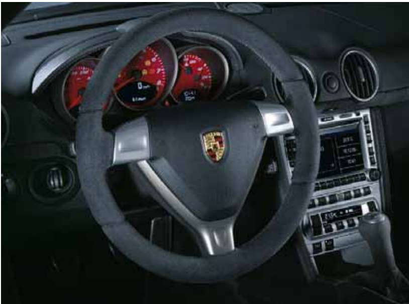
Gripping: The Alcantara-covered steering wheel provides an optimum grip on winding roads

At Porsche, motorsport and our standard road vehicles have always been very closely linked. Things that prove themselves on the racetrack usually find their way into road cars without major modifications. Sportiness comes as standard on every car that leaves our factory. The Alcantara options and red tail lights from the Porsche Tequipment range underscore this strong link with the world of racing.