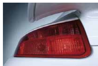
Red light: The tail lights give an exceptionally sporty touch

Further information about the complete product programme of Porsche Tequipment and the latest Tequipment catalogues are available from your Porsche dealer or on the Internet under www.porsche.com