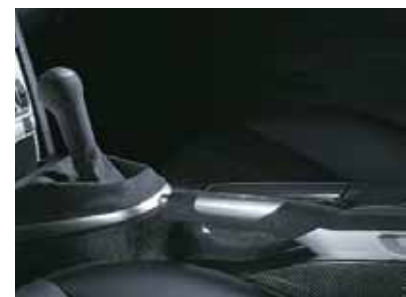
Steady hand: Alcantara coated levers bring a genuine racing feel to your car