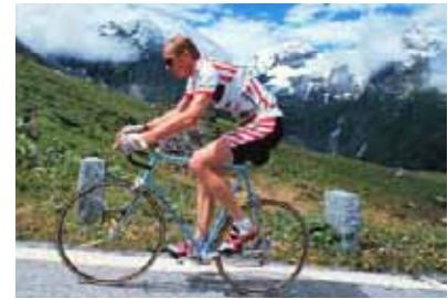
Striving for perfection: Walter Röhrl, without a car for once, conquering the Grossglockne

With his first victory at the Monte Carlo rally, he reached this goal. That was in 1980, the year in which he won his first world championship and fulfilled his “lifetime ambition”. With two further victories in Monte Carlo and a second world championship in 1982, the Bavarian, born on 7th March 1947, was considered the best rally driver of all time. In 2005, amid the snow and ice on the legendary Col de Turini Pass, he appeared as a Porsche representative, introducing the 911 Carrera 4/4S to the press, and he was in his element. Just as he was on the gravel tracks in